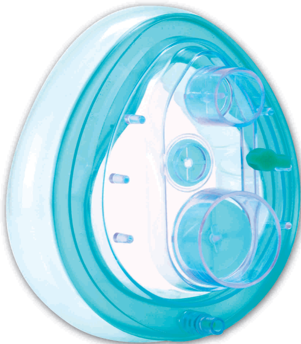
Mask with safety valve