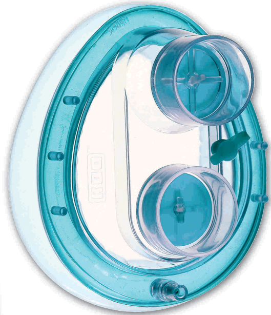
Mask without safety valve